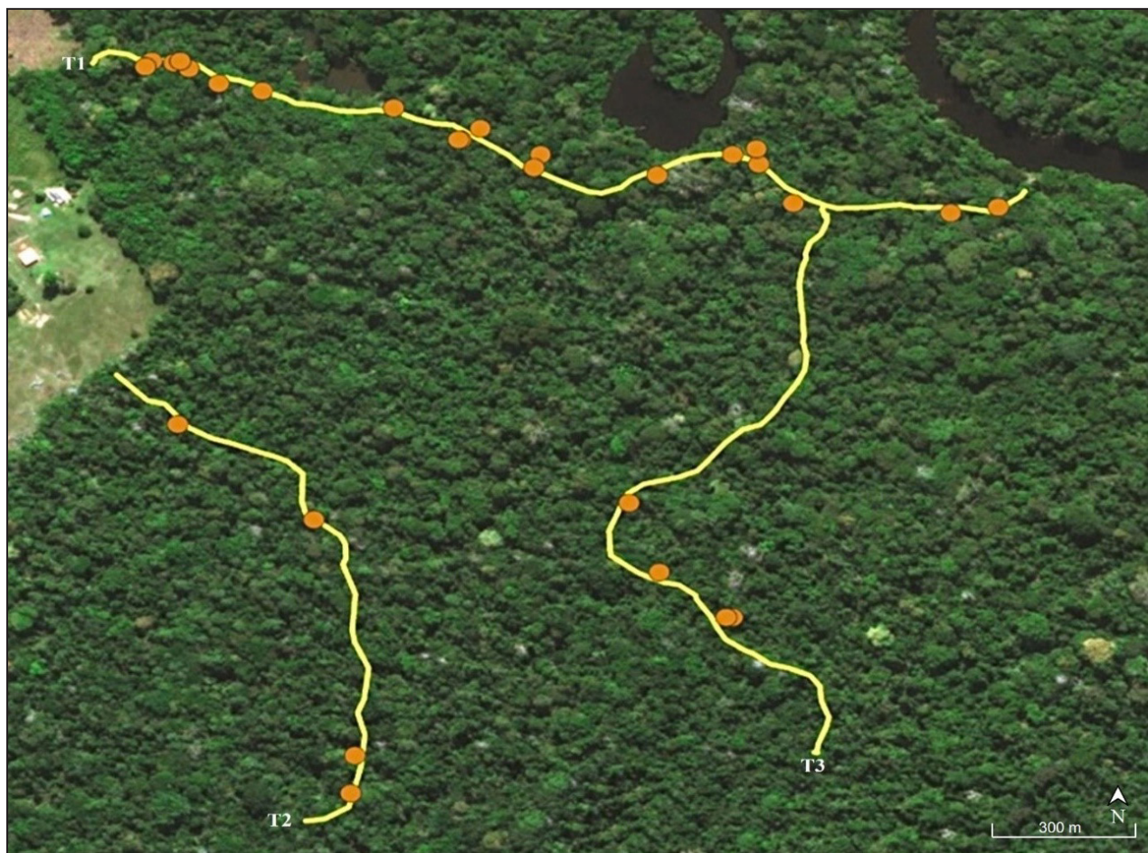
Figure 2. Distribution of records of Bothrops atrox on the three trails during the study period at ARIE Japiim Pentecoste in Cruzeiro do Sul, Acre, Brazil.

The size of the specimens recorded in this study (including all methods!) ranged from 25.5 to 165 cm ( \bar{X} = 81.2 cm) (n = 41), with juveniles measuring